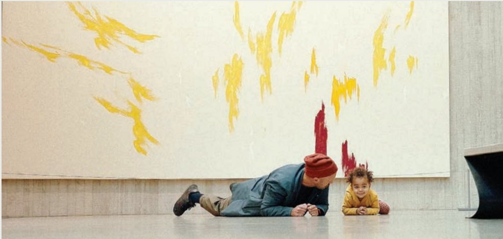
the interpretation team created several artwork labels specifically designed to engage families with young children.

This exhibition kicked off a year-long, community-centered presentation of public programs, exhibitions, and partnerships. Beginning with this exhibition highlighting CSM’s growth over the course of its foundational decade, the Museum’s tenth anniversary celebration evolved in 2022 to articulate goals for the next ten years.